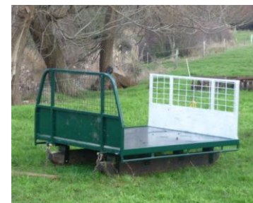
Pictured above is the sledge to be used.