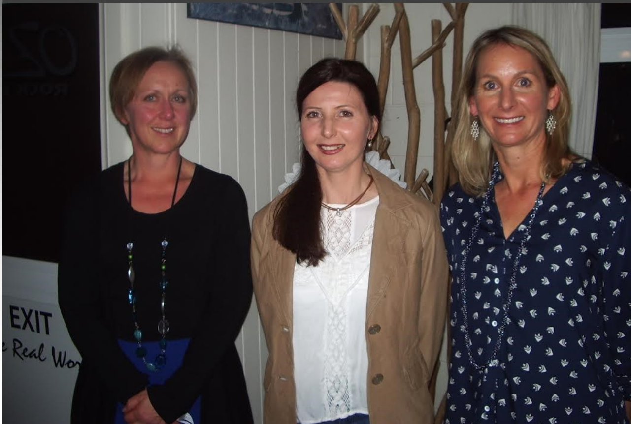
Performance Medal Winners