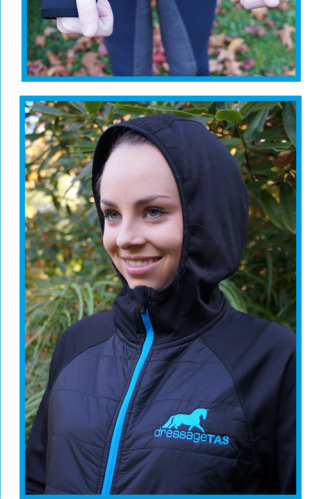
dressageTAS JACKET Price $65.00