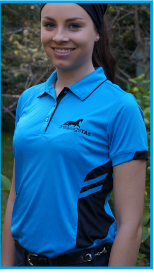
dressageTAS POLO T SHIRT Price $35.00