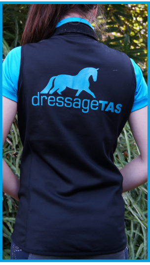
dressageTAS VEST Price $55.00